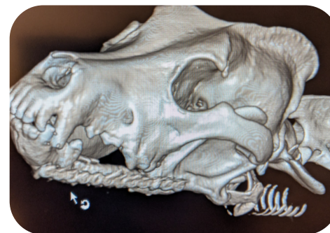
4 MONTH POST-OP

Harnessing the power of rhPDGF & allograft