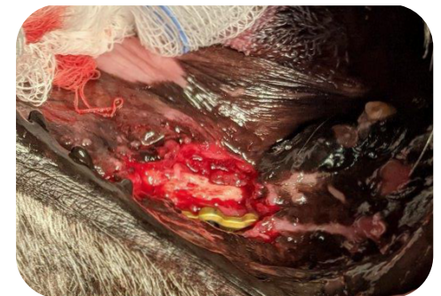
4 MONTH POST-OP