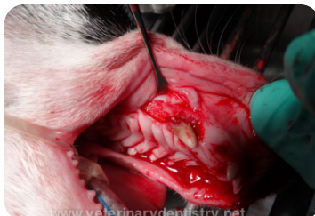
INTRA-OP TO REMOVE DECIDUOUS ROOT TIP