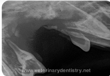
INTRA-OP FRAGMENTS REMOVED

DX: Severe penetrating trauma and caudal fracture to right palate from dog bite.