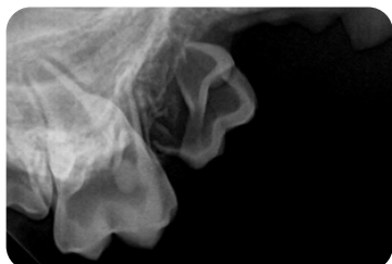
DECIDUOUS PREMOLAR & CANINE ROOT TIP STILL PRESENT

OBSERVATION: Good bone growth and closure of penetration by 8 weeks.