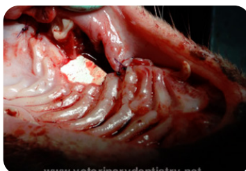
ROSTRAL & CAUDAL CLOSURES