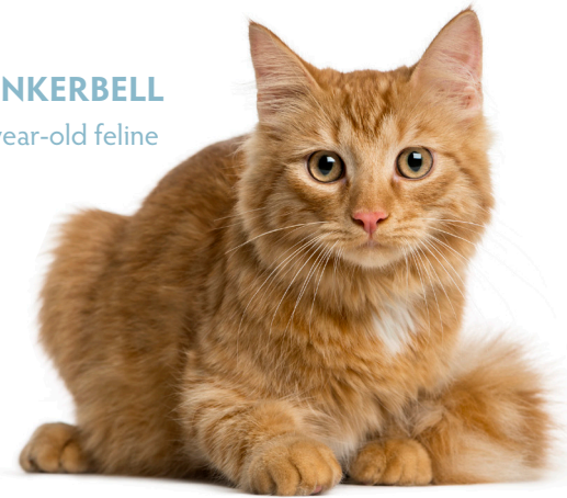
TINKERBELL 3 year-old feline