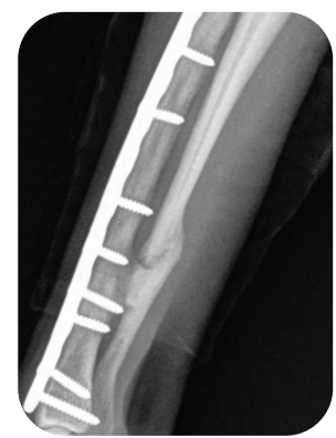
15 WEEKS POST-OP