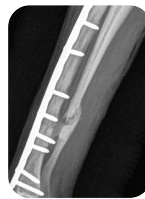
9 WEEKS POST-OP