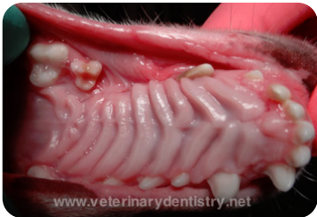
8 WEEKS FOLLOW UP