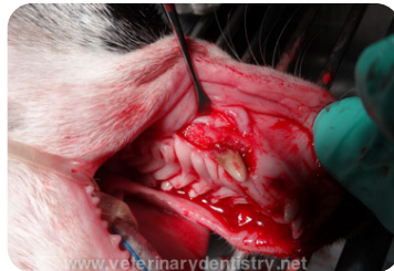
INTRA-OP TO REMOVE DECIDUOUS ROOT TIP