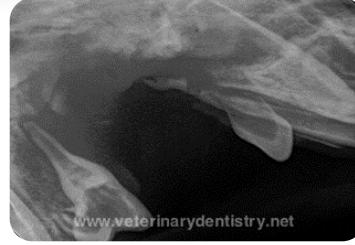
INTRA-OP FRAGMENTS REMOVED

DX: Severe penetrating trauma and caudal fracture to right palate from dog bite.