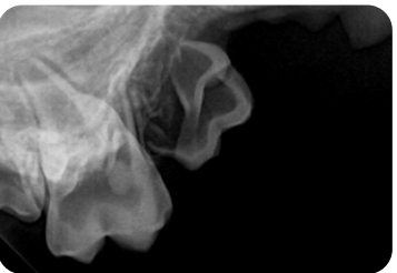
DECIDUOUS PREMOLAR & CANINE ROOT TIP STILL PRESENT

OBSERVATION: Good bone growth and closure of penetration by 8 weeks.