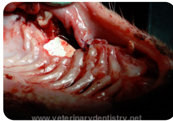
ROSTRAL & CAUDAL CLOSURES