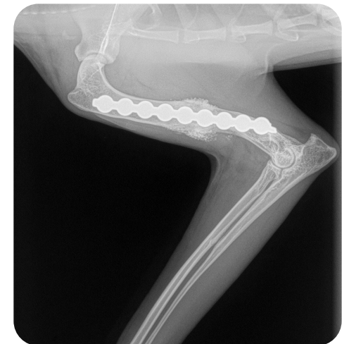
2 MONTHS POST-OP