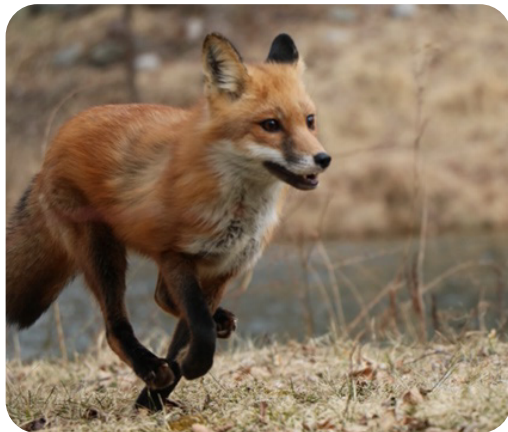
Robin hood heading home to the wilderness.

After only a month of confinement at the rescue, x-rays showed the bone healed nicely. To ensure Robin Hood's bone had fully healed enabling him to hunt and feed for himself again, he was kept for another month. After two months, additional x-rays were taken and confirmed the bone had completely healed so Robin Hood was released into the wild.