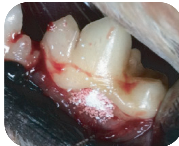
Placement of SYNERGY