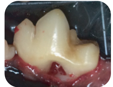
Furcation defect after cleaning and root planning