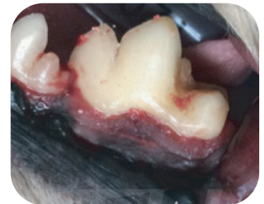
Envelope flap is superglued closed