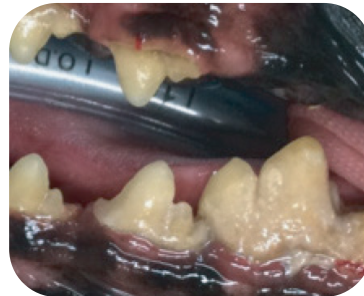
Furcation exposure and probing depth 7-9 mm

At the 6 & 14 month follow-ups, the tooth appeared healthy with a normal 2 mm sulcus depth in spite of minimal home care. Radiographs indicate new bone formation in furcation.