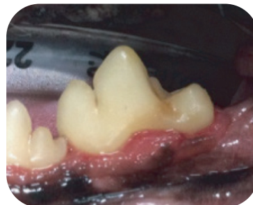
Normal gingival height and probing depth 1-2 mm