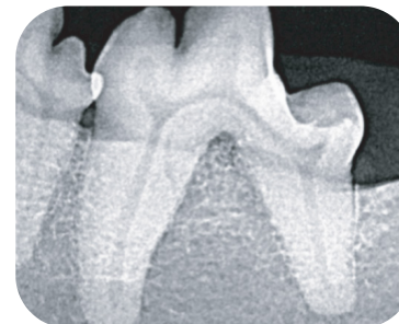
Furcation bone height restored