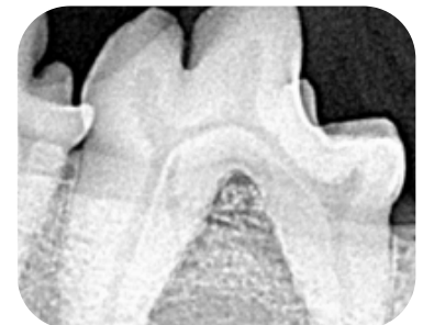
Normal 2mm probing depth