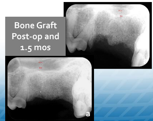
Bone Graft Post-op and 1.5 mos