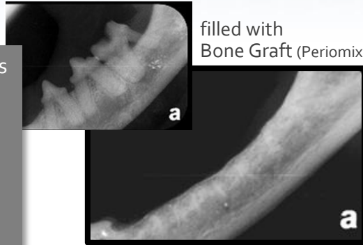
Normal anatomy emerging with good integration.

Only real bone graft is capable of regenerating normal anatomy, fully integrating with the host bone and maintaining ridge height.