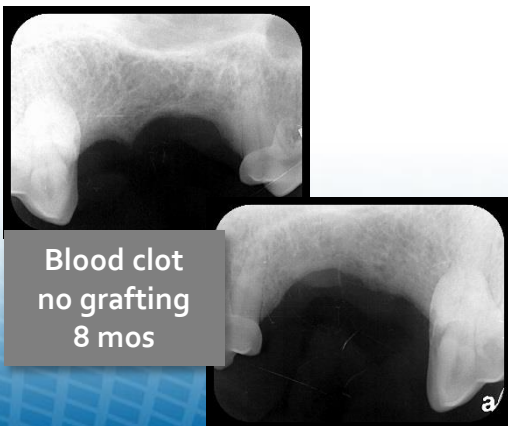
Blood clot no grafting 8 mos