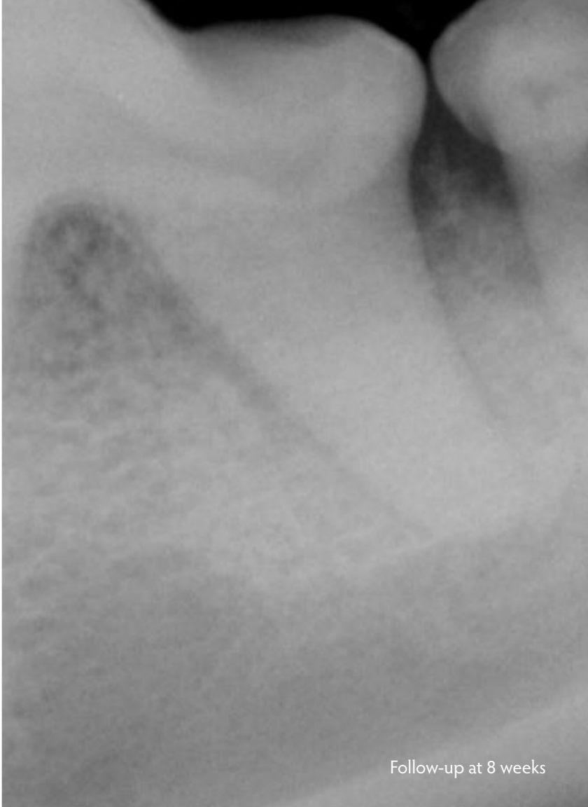
Follow-up at 8 weeks